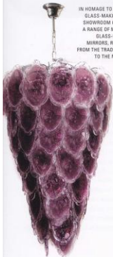
IN HOMAGE TO ITALIAN GLASS MAKING, THE SHOWROOM CARRIES A RANGE OF MURANO GLASS-FRAMED MIRRORS, RANGING FROM THE TRADITIONAL TO THE MODERN